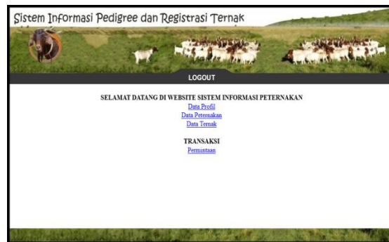
Figure 6. Home Page Display

This web-based application is accessible using general browser. The difference from the application for breeders is user couldn't use RFID reader with this web-based application. This website contain information about livestocks, goat farms, and livestock's transactions. In general, this website contains a "Home" page, "Data Pemilik" or owner's profile page, "Data Peternakan" or goat farm's profile page, and "Informasi Permintaan" or request information page. Home page is the main page. There are two main menus, thus are data maintenance and transaction. Each of those main menu has several sub menus. On the left bar there are menus to home page and logout. The display of the home page is shown in Figure 6.