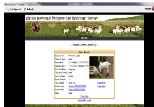
Figure 5. Result Display from Successful Read