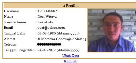
Figure 7. Owner Profile Display