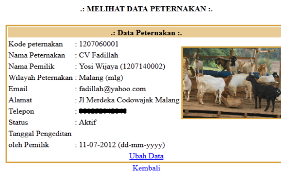
Figure 8. Goat Farm Profile Display