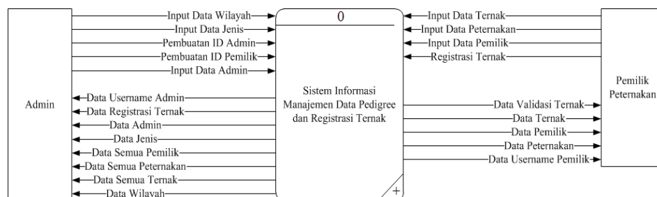
Figure 2. Context Diagram

From those informations and considering several factors, a context diagram have been made like in Figure 2 then the process is divided into several sub-process fit to hierarchical diagram like in Figure 3. Those context diagram has two external entity, that is admin and owner ( pemilik peternakan ), and the data flow is related to each other.