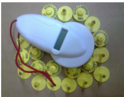
Figure 4. RFID Ear-Tag and Reader

To registering the livestock, every newborn livestock would be given an RFID ear-tag and its data will be added into the online database server. Next, livestock data could be managed by each breeders. Livestock validation then could be done with scanning the ear-tag with the RFID scanner integrated to the application system. To read the RFID ear-tag, reader's position must be at least 7 cm from the tag. When the registration number has been read, all the livestock data will be displayed.